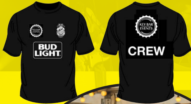
Staff T-shirts and hoodies